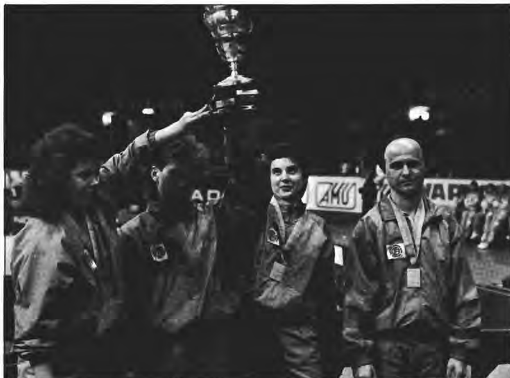
The Hungarian Ladies Team with Coach delighted with their "golden" performance