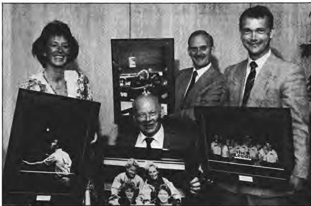
A PICTORIAL PRESENTATION FROM THE LEEDS