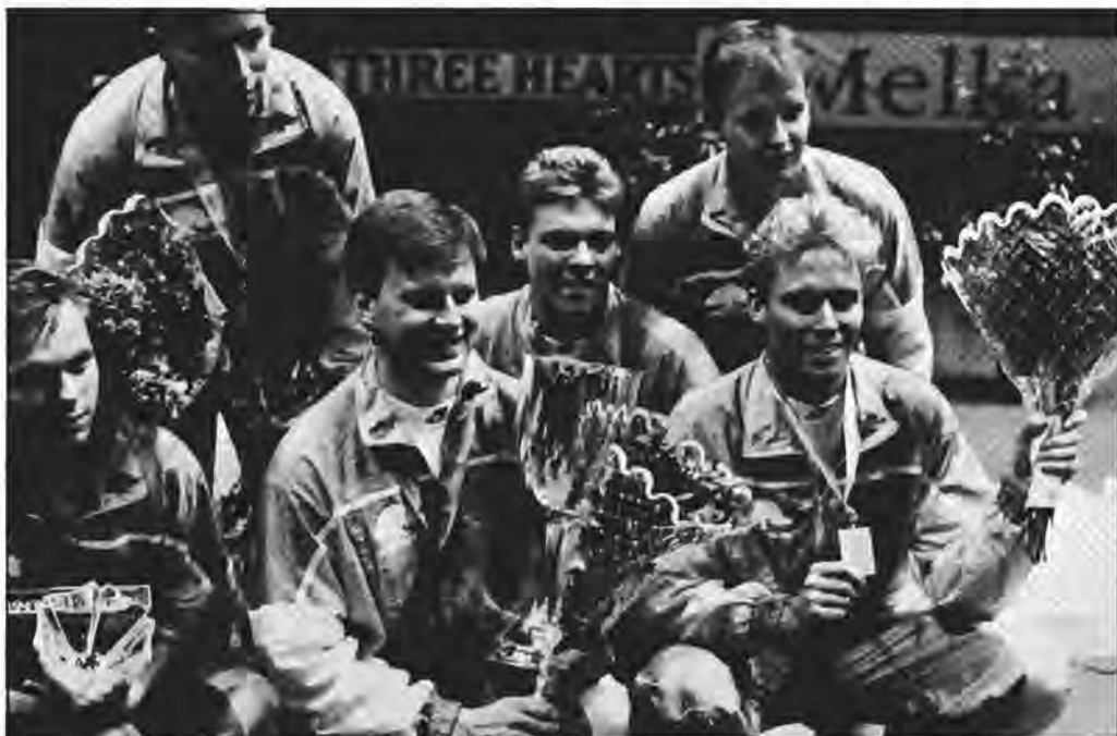
Sweden's Mens Team — Champions of Europe