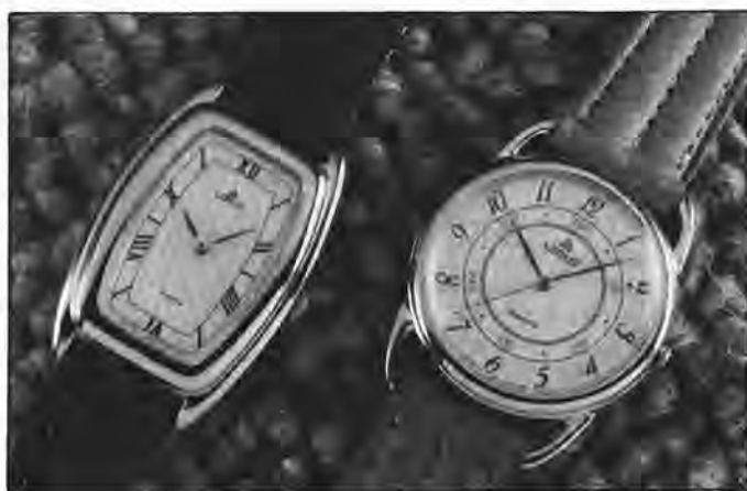
The picture shows two smart, yet functional watches by Lorus Quartz. The oblong ladies' watch has a white dial with Roman numerals and a black strap. It costs around £24.99. The round man's watch has traditional black Arabic figures on a white dial. In between the inner and outer track are featured the degrees of a circle. The watch has black leaf shaped hour and minute hands and a red second hand. It has a stitched tan strap and costs around £26.99. (From jewellers throughout the UK)