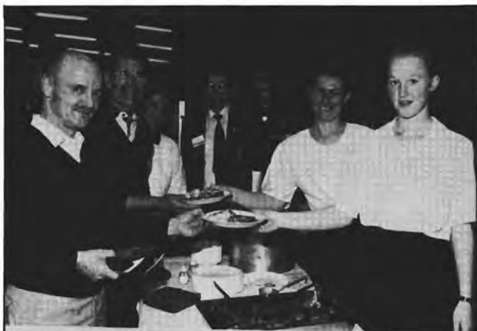
THE BATTLE between Vets and Umpires to be first at the dinner table was invariably won by the wily tactics of the mature players. The rush was well merited, the Oldham staff served up superb food in difficult conditions.