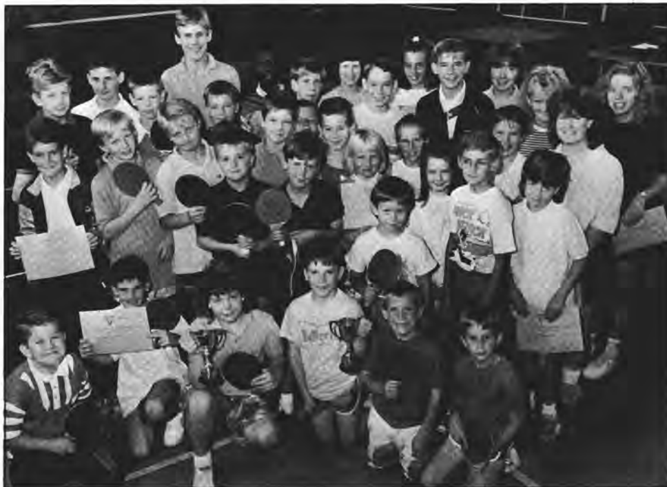
Left: Wakefield Festival of Sport Table Tennis Coaching Course Beginners and Intermediates Course, with some of the advanced players who helped the coaches on the course. Sponsored by G.B.Trophies and Wakefield Coaching Trust.